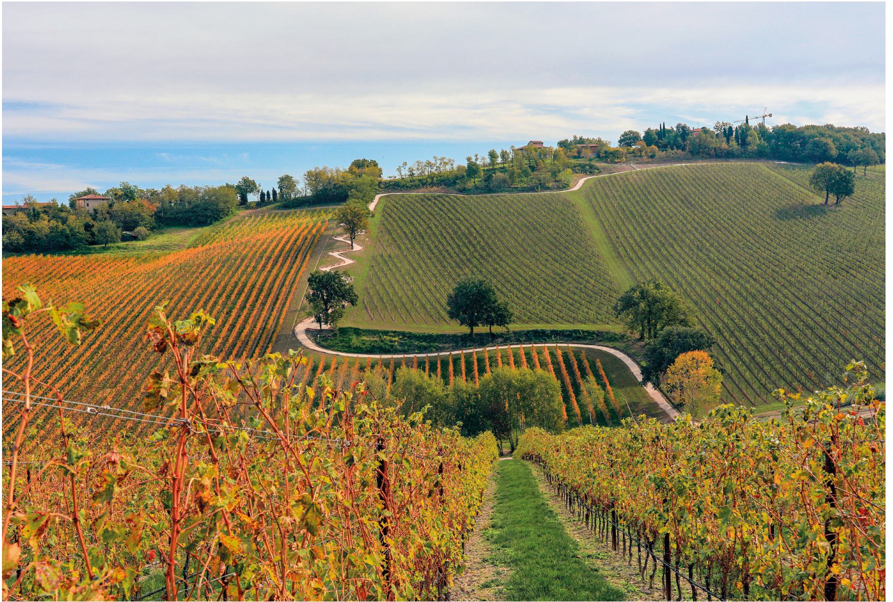
Anfiteatro della Vigna. The Nature Therapy approach