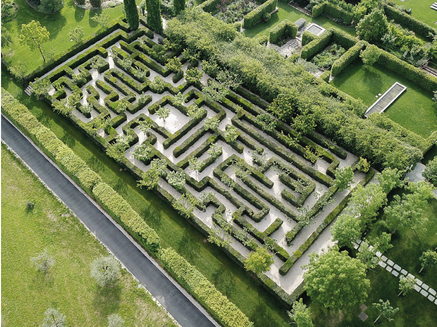
Labyrinth. Location for Green Bathing experiences