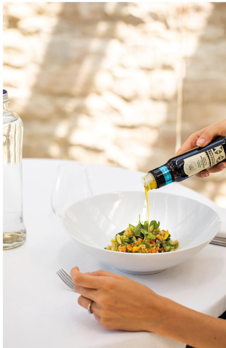
Ground to table products

The products made on site include: low-sugar jams, hazelnut cream, wines, saffron and salts with herbs that reduce the amount of sodium and add flavor. These are ingredients exported on an international scale and that, in the hands of the skillful and creative chefs of the resort, become the stars of tailor-made menus.